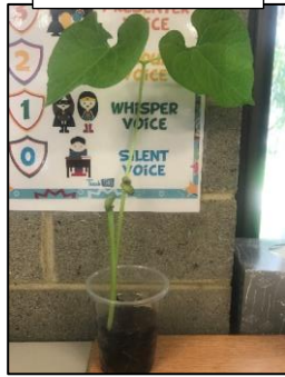
Week 2 Growth