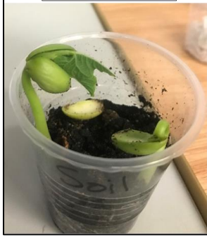
Week 1 Growth