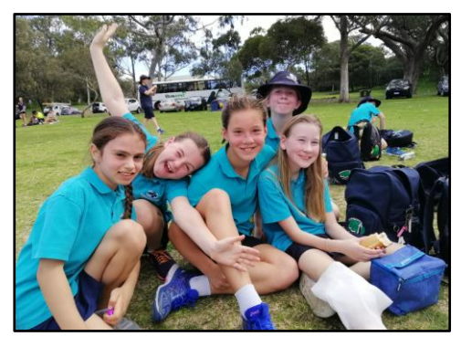
Respect | Doing your best | Honesty | Valuing others | Responsibilities